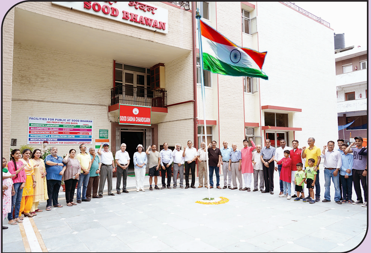
Flag hoisting on Independence Day at Sood Bhawan, Sector 44-A, Chandigarh

• Sood Sandesh ₹ 500/- (Membership for ten years)